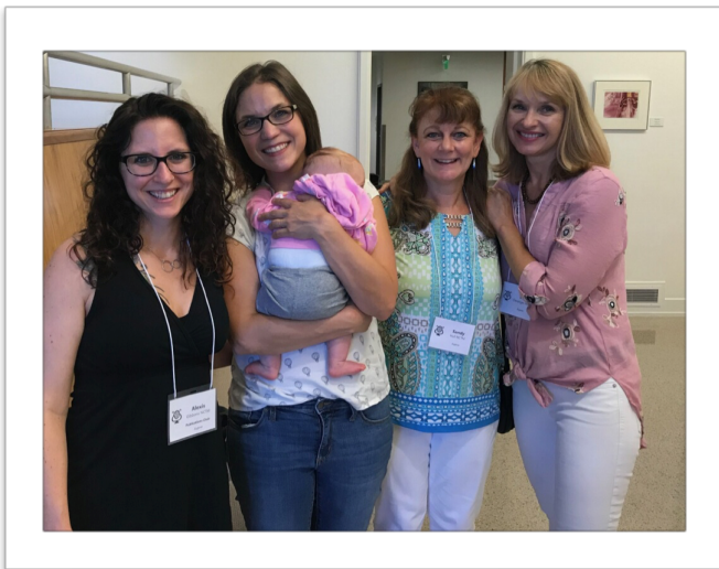
Some OMTA members enjoying a break...