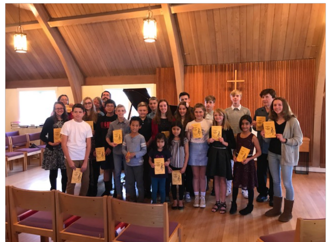
Students and teachers at the Festival of Popular Music, Sunday October 27