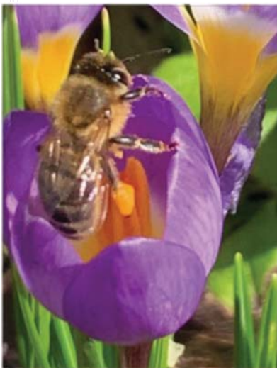
Bee kind, buzzing...